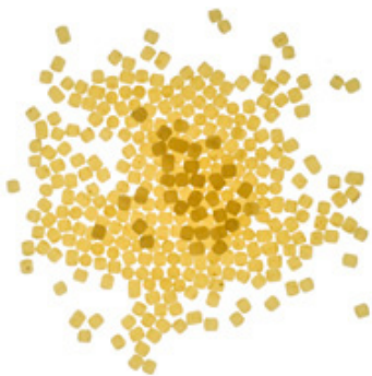
ACINI DI PEPE

Here's a guide to help you tell your paccheri from your penne, your rotelle from your rotini. For more info on the sauces for each pasta, go to www.chow.com/stories/11099 .